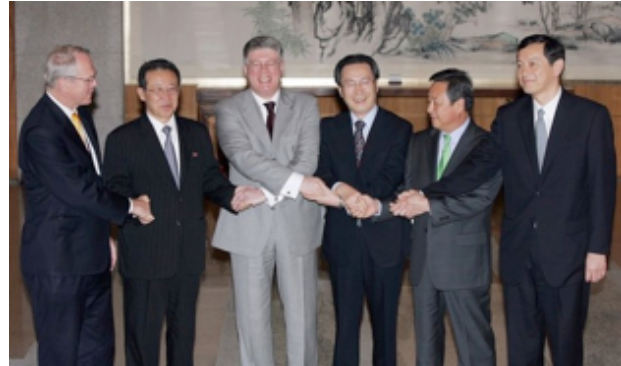
Envoys to the Six-Party Talks shake hands at the beginning of a round of the talks in Beijing on July 10, 2008.

Economic diplomacy is an important factor in Japan's diplomatic strategy. Focussing discussion on the political context, Tokyo's diplomatic cards and policies of the Prime Ministers in office since the initiation of the Six-Party Talks, we argue that Japan has deliberately adopted the role of spoiler in multilateral negotiations. [7]