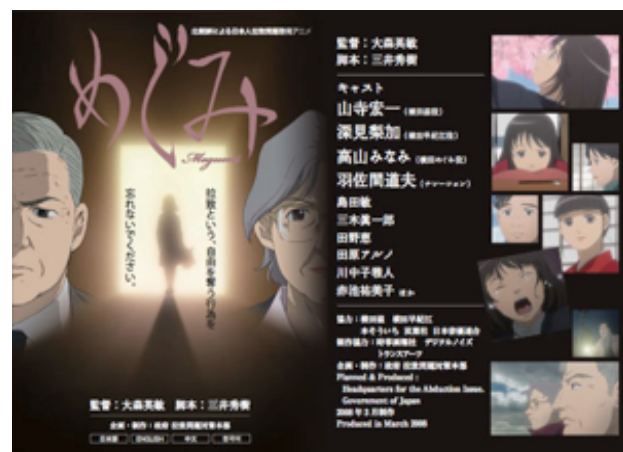
Poster of the animation film 'Megumi', released by the Japanese government internet television in March 2008 and available for free rental in video

The prime ministers who ruled Japan since the initiation of the Six-Party Talks in 2003 have taken very distinct policies with regard to North Korea. [22] Unsurprisingly, changes in bilateral policy did not fail to leave their impact in the multilateral setting. Prime Minister Koizumi Junichiro revamped bilateral talks in 2000 through the resumption of formal normalization talks, which had been stalled since 1992. He left an important legacy with the first bilateral summits in history, in September 2002 and May 2004. This engaging approach went against the course of President Bush, who early in 2002 famously included North Korea in an 'Axis of Evil.' During the first summit Koizumi and North Korean leader Kim Jong-il adopted the Pyongyang Declaration, which formally stated that both sides would 'make every possible effort' for an early normalization of relations. [23] The Japanese government moved away from Koizumi's conciliatory approach, however, when it stalled official talks in 2002 due to its dissatisfaction with Pyongyang's handling of the abduction issue. [24]