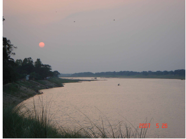
A view of the Brahmaputra River

Brahmaputra waters would begin no sooner than China began to build the world's largest hydropower plant on the river's Great Bend.