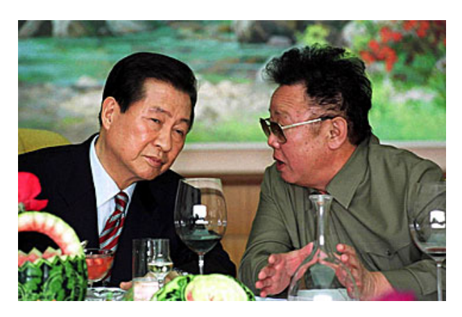
Kim Dae-jung and Kim Jong-il on June 15, 2000

From all available indications, it is clear that the North does not want to talk to the South, unless the conservative South Korean government accepts the two summit agreements of June 15, 2000 and October 4, 2007. The Rodong article alleged that "the negation" of the two agreements "means denying the ideology and system in the DPRK and seeking confrontation."