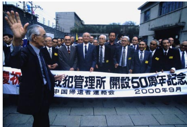
Chukiren celebrates its fiftieth anniversary in September 2000

Unfortunately, as we entered the year 2000, our average age surpassed 80, and many of those who worked tirelessly began to pass away.