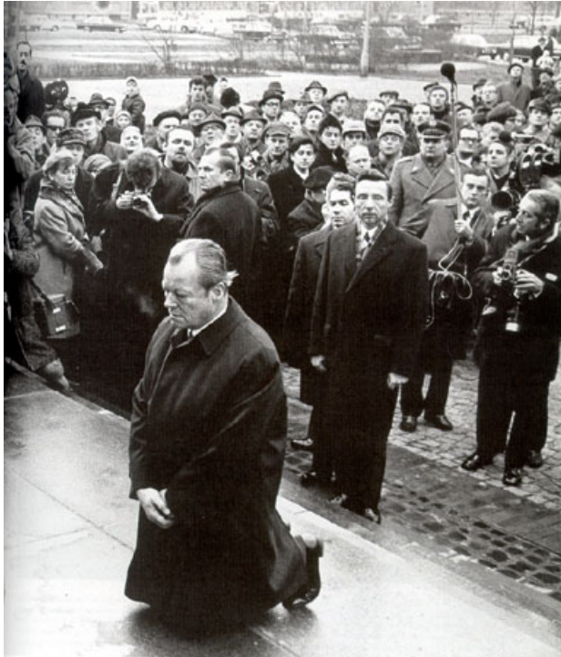
Willy Brandt at Warsaw, 1970

Comparison of the Japanese and German cases thus raises a puzzle. Japan's modest efforts to offer contrition repeatedly triggered sharp outcry among conservatives, who justified and even denied past atrocities. Because of backlash, Japanese contrition ended up alarming Japan's neighbors. In Germany, by contrast, far more ambitious efforts at contrition did not provoke a similar backlash. Though some West German conservatives preferred to emphasize a more positive national history, they did not deny or glorify Nazi crimes. The French thus viewed West German debates about the past as healthy, cathartic experiences for the country's democratic development—and as a reassuring signal about its intentions.