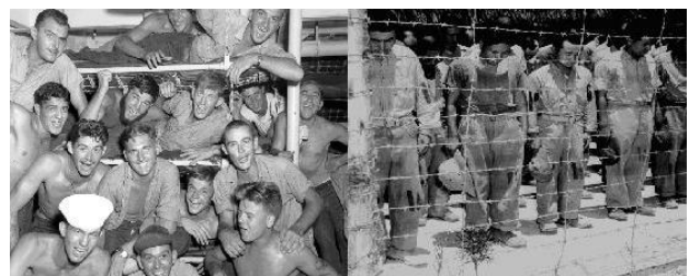
How will their countries remember them? How will their adversaries remember them? Left, American GIs celebrating Japan’s surrender, 1945; Right, Japanese POWs in Guam

Why might apologies matter in international politics—that is, why are they not merely dismissed as “cheap talk”? Apologies—or more broadly, national remembrance—matter because the way countries represent their pasts conveys information about foreign policy intentions. As countries remember, they define their heroes and villains, delineate the lines of acceptable foreign policy, and send signals about their future behavior.