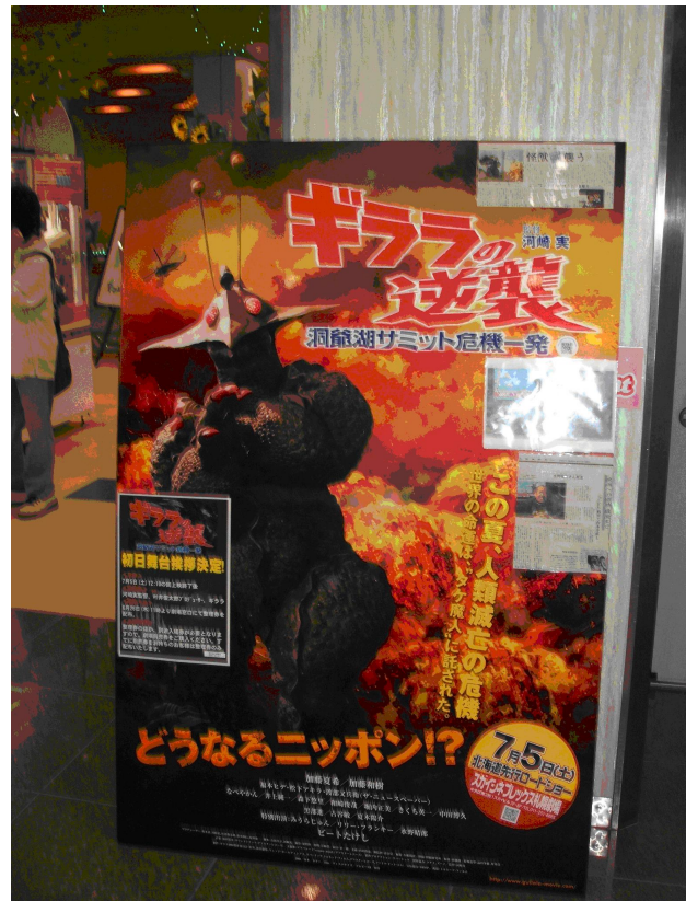
Guilala Strikes Back!

It's not often you hear or read this combination of words in the same sentence but surely this year's summit meeting of the Group of 8 (G8) leaders will be etched on people's memories for generations to come. Nobody could have predicted the cataclysmic events that unfolded on the northernmost island of Japan in the summer of 2008: the city of Sapporo attacked by the vengeful space monster Guilala; the leaders of the G8 countries united in their efforts to destroy the creature; former Prime Minister Koizumi Junichiro ended recent speculation and returned to take over the reigns of power in a time of crises; and the G8 leaders taken hostage by Kim Jong-II. For an annual diplomatic event that is often portrayed as little more than a meaningless ceremony, this has to have been one of the most unforgettable summits in its thirty-three history. At least that's what happened if you only watched the highly amusing monster movie Girara no GyakushÅ«: Toyako Samitto Kiki Ippatsu ( Guilala Strikes Back: Crisis at the Lake Toya Summit ) premiered in Hokkaido the weekend before the G8 summit began.