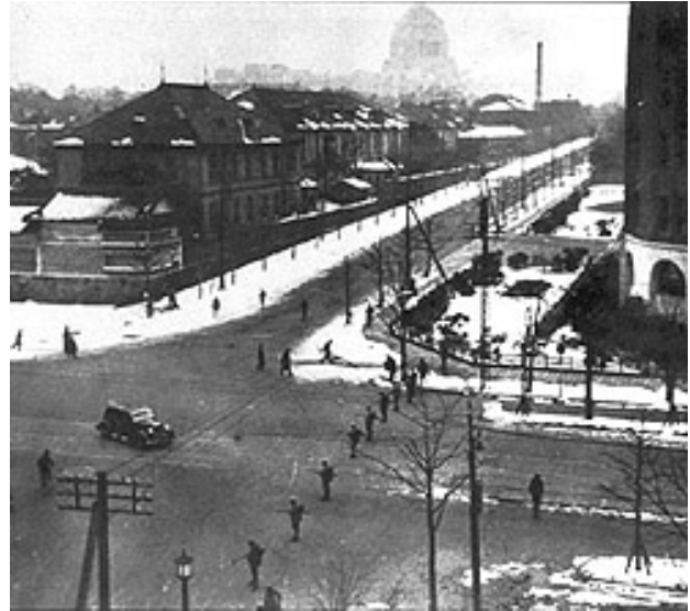
Japan’s foreign ministry surrounded by military mutineers in 1936

Reacting against this “sleaze,” the military led attempted coups on May 15, 1932 and on February 26, 1936.