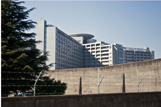
Tokyo Detention House

On the morning of June 17, four days after Hatoyama signed the documents, breakfast was served at 7:25 a.m. as usual to Miyazaki and other inmates on the eighth floor of Building A of the Tokyo Detention House in Tokyo's Kosuge district.