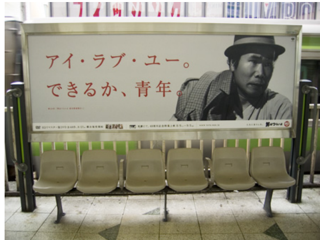
Billboard showing the hero of Otoko wa Tsurai yo.

After his release, the prisoner learned that a death-row inmate was watching the movie.