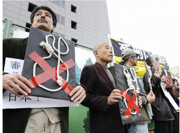
November 6, 2008 Tokyo protest against the death penalty