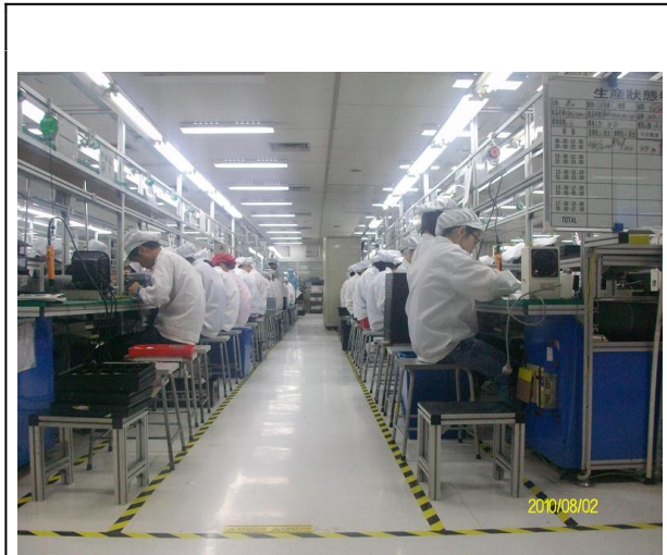
Foxconn assembly line

Foxconn's '8S' policy is built upon the '5S' Japanese management method to improve efficiency and organisational performance, which refers to Seiri (sort), Seiton (set in order), Seiso (clean), Seiketsu (standardise the first '3S' procedures), Shitsuke (sustain the efforts of seiri, seiton, seiso and seiketsu), to which are added Safety, Saving and Security to the Taiwanese/Chinese system. Such principles are enforced rigorously, as Yu experienced.