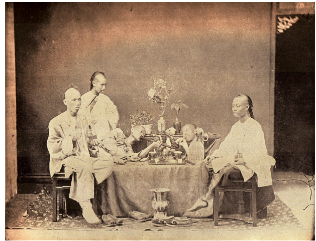
Opium Den Concession at 1893 Chicago World's Fair

Exposition in Chicago. The 1904 Olympics were apparently the first Olympics to be reported in the press back in China.