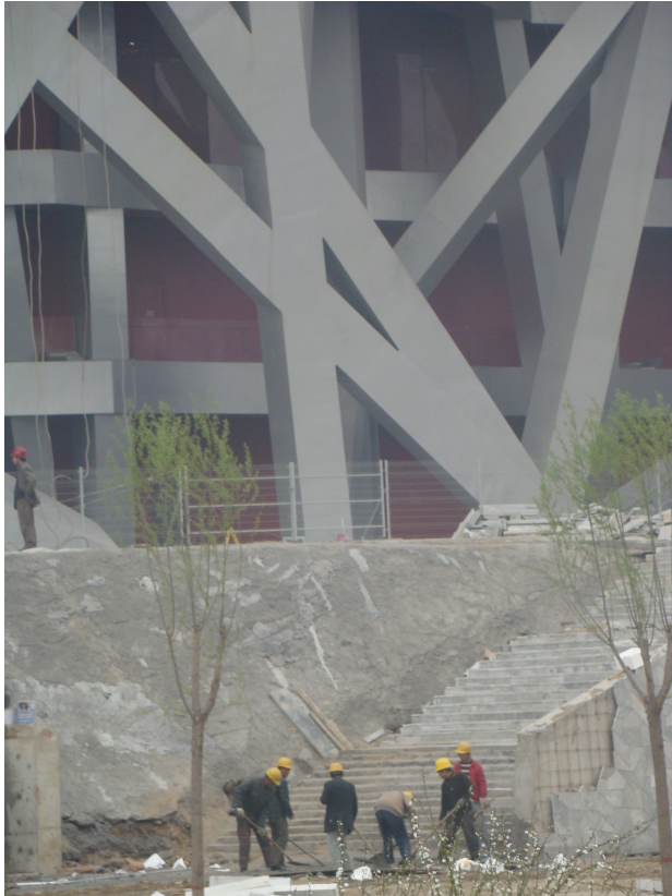
Workers put the finishing touches on the National Stadium (“Bird’s Nest”). Photo by Susan Brownell, April 8, 2008.

The most relevant historical lesson from 1904 is that existing powers do not necessarily welcome newcomers with open arms. As happened to the U.S., there are suggestions that Chinese views about the purposes of Olympic sport conflict with the “correct” (i.e., dominant) views. It may happen that future Olympic histories written by Westerners will record that the Beijing Games were a low point in Olympic history, and London 2012 “saved” the Games.