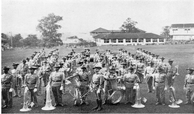
The Philippine Constabulary Band. From The Greatest of Expositions (St. Louis: Louisiana Purchase Exposition Co., 1904) , p. 226.

That the Old World was not completely happy about the emerging New World is evident in the European criticism of the Olympic Games. IOC president Pierre de Coubertin said that awarding the Games to St. Louis had been a “misfortune” and recalled, “So the St. Louis Games were completely lacking in attraction. Personally, I had no wish to attend them. [...] I had a sort of presentiment that the Olympiad would match the mediocrity of the town.” He complained about “utilitarian America.” He also labeled as “embarrassing” the Anthropology Days, in which natives who had been brought to the fair for the ethnic displays competed in some track and field events and pole-climbing, and compared their performances unfavorably with those of the “civilized” men who took part in the Olympic Games.