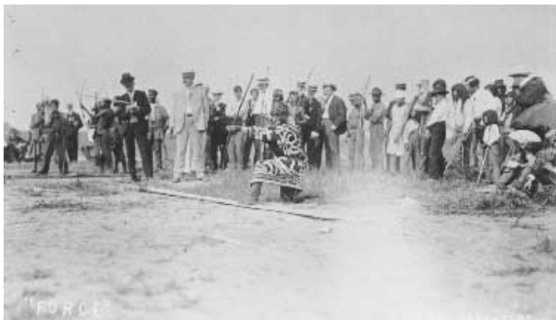
Ainu from Japan competing in archery contest.

That the Old World was not completely happy about the emerging New World is evident in the European criticism of the Olympic Games. IOC president Pierre de Coubertin said that awarding the Games to St. Louis had been a “misfortune” and recalled, “So the St. Louis Games were completely lacking in attraction. Personally, I had no wish to attend them. [...] I had a sort of presentiment that the Olympiad would match the mediocrity of the town.” He complained about “utilitarian America.” He also labeled as “embarrassing” the Anthropology Days, in which natives who had been brought to the fair for the ethnic displays competed in some track and field events and pole-climbing, and compared their performances unfavorably with those of the “civilized” men who took part in the Olympic Games.