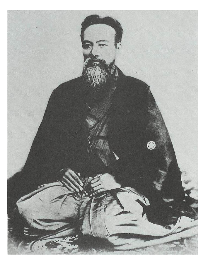
Yamaoka Tesshu, founder of the Shumpukan School of swordsmanship.