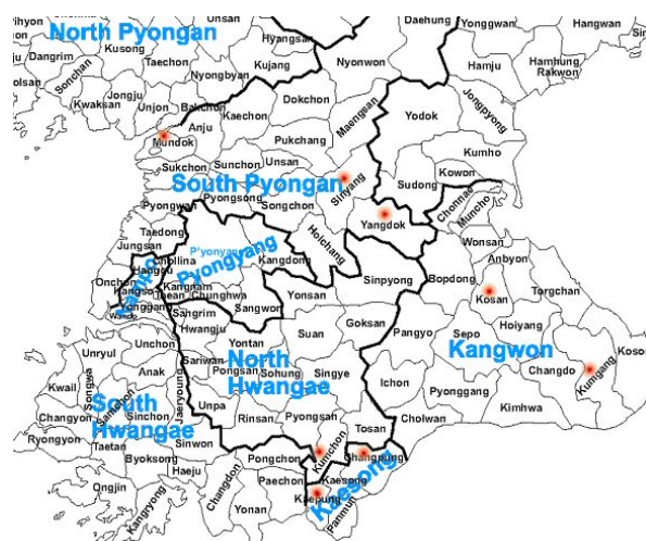
Maps of the Areas Alerted with Food shortage Enlarge the lower map

With the start of the spring season, the food shortage is increasing rapidly all across the