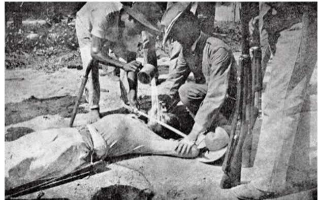
The water cure

soldiers to testify regarding the practice of torture, including the “water cure.” Their accounts triggered a response by Secretary of War Elihu Root that included the minimization of atrocity and the inauguration of court-martial proceedings for some soldiers and officers accused of torturing Filipinos.