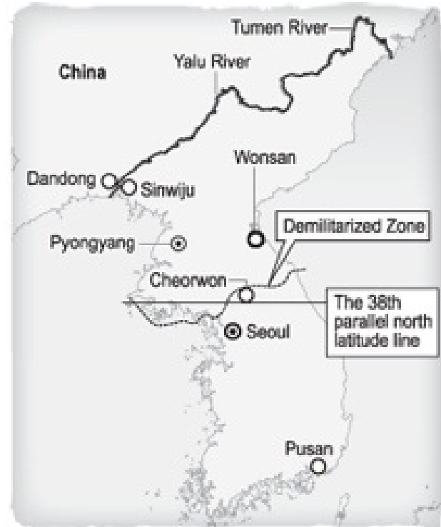
A Divided Korea and the Chinese border

In September 1945, the United States and the Soviet Union established the 38th parallel to demarcate their respective zones of control on the Korean Peninsula. The 38th parallel became the de facto North-South border when Korea was officially split in 1948.