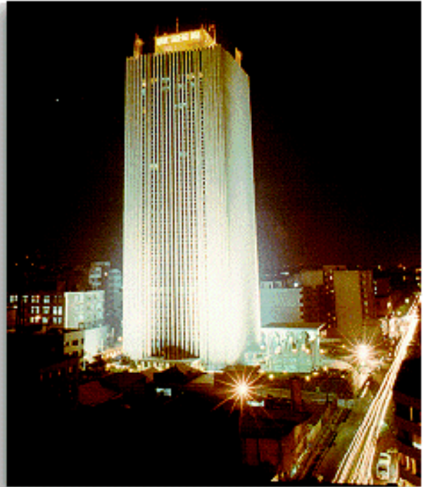
Head office - TEHRAN, IRAN

Hammering away at Iran's state-owned banks is central to US efforts to raise an international hue and cry. Through its state-owned banks, FinCEN states, "the Government of Iran disguises its involvement in proliferation and terrorism activities through an array of deceptive practices specifically designed to evade detection." By managing to get inserted the names of two state-owned banks in the most recent UN Security Council resolution on Iran, the US can now portray the cream of Iran's financial establishment (Bank Melli and Bank Saderat are Iran's two largest banks) as directly integrated into alleged regime involvement in a secret nuclear weaponization program and acts of terrorism.