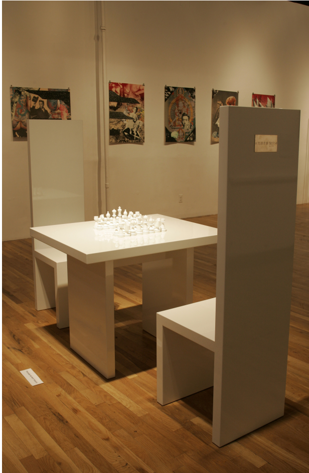
Yoko Ono, "White Chess Set"

SW: To be honest, I do not know her exact opinion on Article 9. However, her "Peace Art" aims at perfect and absolute peace, which is completely different from any other artist I know.