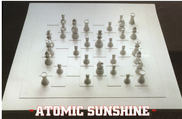
Postwar Japanese Art under Peace Constitution Article 9

The exhibit was in Tokyo from August 6-24, 2008. An exhibit is also planned for Okinawa in 2009.