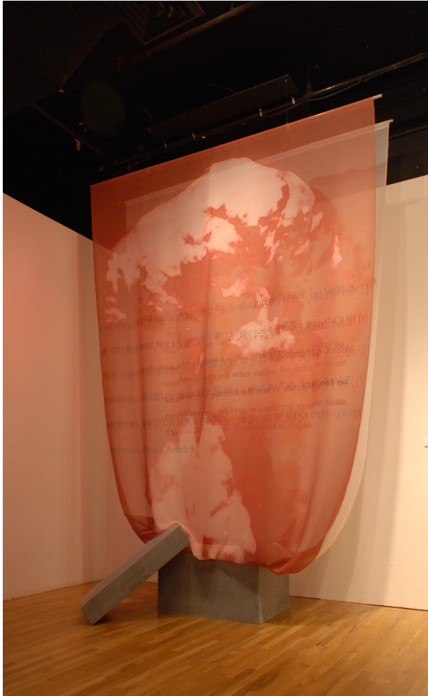
"The Forbidden Box" by Yanagi Yukinori

JD: Yanagi Yukinori was also censored in the 1990's by a gallery in Japan because of a series of prints that dealt with imperial identity and official discrimination against Korean nationals.