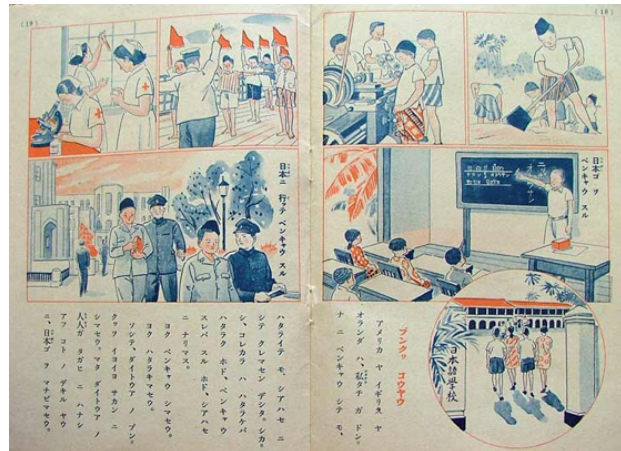
[Next to blackboard:] Studying Japanese [Lower left picture:] Going to Japan to study [Sign on gate in round picture:] Japanese language school

America, England, the Netherlands and others did not make us happy no matter how hard we studied or worked. However, from now on, the more we work, and the more we study, the happier we will become.