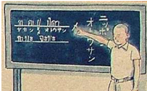
[Behind teacher's arm:] Japan, father

Let's make the culture of Greater East Asia flourish more and more. In order that the peoples of Greater East Asia can communicate with each other, let's learn Japanese.