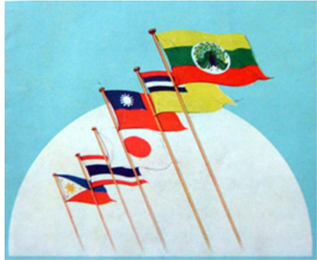
[Flags left to right: 1. Philippines 2. Thailand 3. Japan. 4. The Chinese Republic 5. Manzhouguo 6. Burma . . . all under Japanese direct or indirect control from 1942]