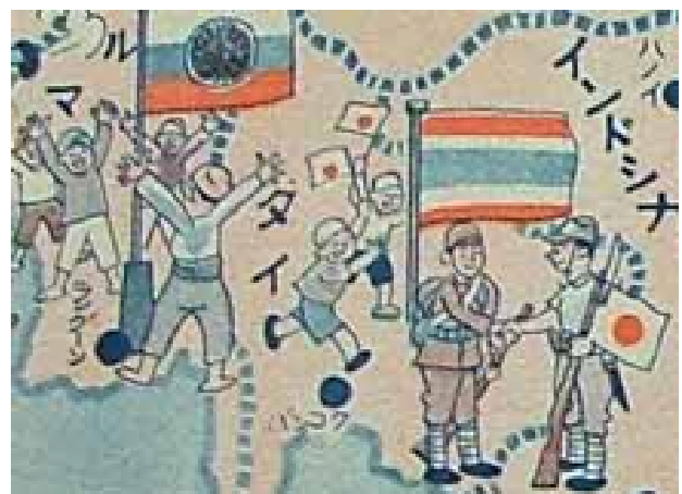
[From left:] Burma, Rangoon; Thailand, Bangkok; Indochina, Hanoi