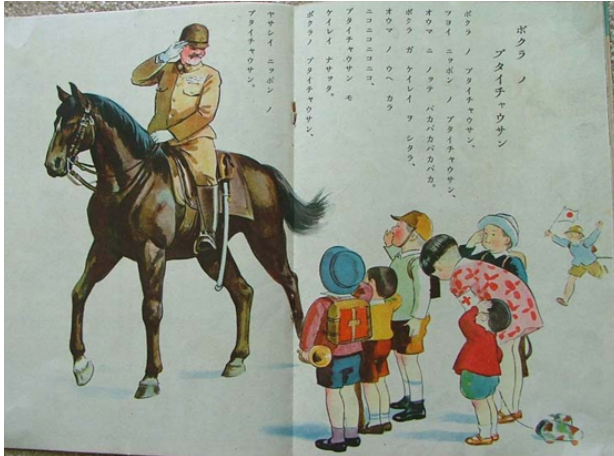
Our commander, strong Japanese commander, is riding on horseback, clip-clop, clip-clop. When we saluted him, the commander returned our salute, smiling brightly from atop his horse. Our commander, kindhearted Japanese commander.