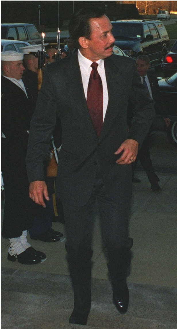
Sultan Hassanal Bolkiah

whether from domestic (dynastic) or external shocks.