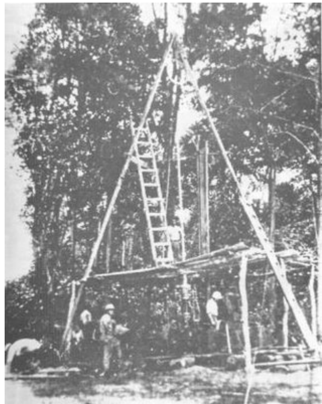
Shell drilling rig in Brunei, 1926

The Shell group of companies, which, from 1913, pioneered the search for oil in Brunei and, from 1929, commenced the exploitation of Brunei's hydrocarbon resources, made Brunei, upon its full independence in 1984, one of the richest states in the world. Notably, however, Brunei is not a member of the Organization of Petroleum Exporting Countries (OPEC), and, as a relatively small producer country, is not officially constrained by OPEC production quotas.