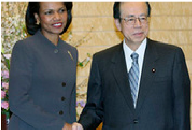
Secretary of State Rice expressed "regret" in meeting with Prime Minister Fukuda

Occasionally the remorse goes up to the Pacific commander-in-chief or, in the most recent case, to the secretary of state. On February 27, Condoleezza Rice said, "Our concern is for the girl and her family. We really, really deeply regret it." The various officers responsible for the discipline of US troops in Japan invariably promise to tighten supervision over them, who currently number 92,491, including civilian employees and dependents. But nothing ever changes. Why?