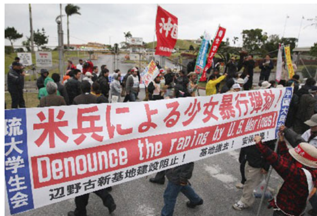
Okinawan protest at Marine Headquarters in Kita Nakagusuku village following news of the rape

Once an incident "blows over", as this latest one now has, the pundits and diplomats go back to their boiler-plate pronouncements about the "long-standing and strong alliance" (Rice in Tokyo), about how Japan is an advanced democracy (although it has been ruled by the same political party since 1949 except for a few years after the collapse of the Soviet Union), and about how indispensable America's empire of over 800 military bases in other people's countries is to the maintenance of peace and security.