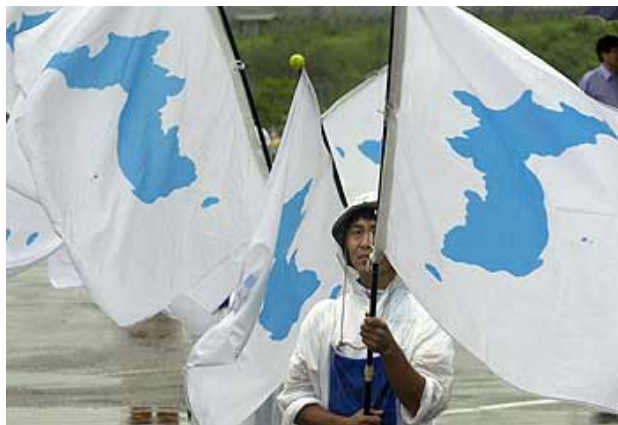
The unification flag used since 1991

During 2007 formal inter-Korean talks on a joint Olympic team took place in Kaesong in February, with more informal contacts in Kuwait in April and in Hong Kong in June 2007, but no solution was achieved. There is considerable agreement on issues such as the flag (the unification flag), the national anthem to be played when medal winners are on the podium (the 1920s version of the traditional Korean folk song 'Arirang'), and the uniforms (following earlier designs but all supplied by the South). One key area remains outstanding - and it is an issue that has remained since those early days of the 1960s - how to choose the athletes to compete.