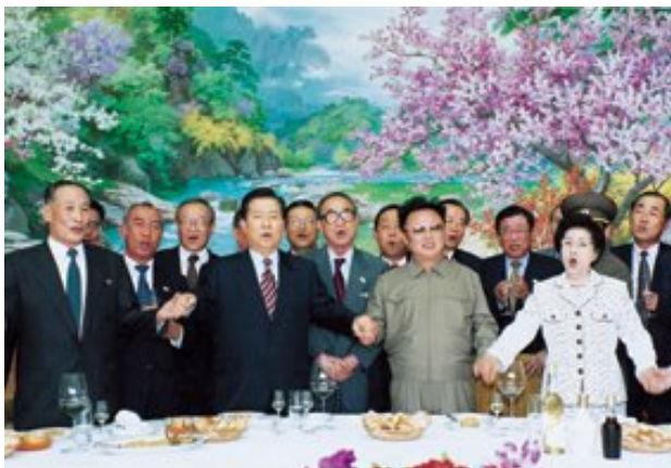
The two Kims and entourage following the June 15, 2000 Joint Declaration

The historic June 2000 summit between Kim Dae-jung and Kim Jong Il, in Pyongyang, opened the way for greater cooperation and collaboration in North-South Korean relations. Consequently, at the 2000 Sydney Olympics the two Koreas entered the Olympic stadiums under a joint flag (the so-called 'unification flag', consisting of a blue outline of the undivided Korean peninsula on a white background) and wearing identical uniforms at the opening ceremonies. It was an emotional moment for Koreans. However, the athletes competed as two separate national teams.