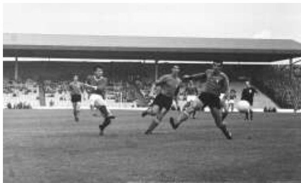
Pak Doo-ik kicks North Korea's winning World Cup goal against Italy

during his years in office. In North Korea too sporting activity became an important part of societal mobilization and development. Mass sports involving gymnastics became a regular feature of North Korean society. Nonetheless, throughout the 1960s and 1970s both Koreas remained relatively low-key in terms of participating in international sporting events, with the notable example of the North Korean soccer team's almost legendary exploits in the 1966 World Cup in England.