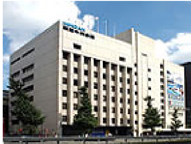
The headquarter of Choryeon (top) and Mindan (bottom) in Tokyo

When the war ended, there were 2.4 million Koreans in Japan, most of whom were repatriated during the years immediately following Japan’s defeat. Repatriation took place in a chaotic atmosphere, with virtually no administrative assistance provided by the Japanese or Occupation authorities. By 1948, only about 590,000 Koreans remained in Japan.[10] During the early years of the US Occupation (1945-47), leftist movements in Japan regained momentum. Koreans joined this wave by maintaining strong connections with working-class, progressive, and communist forces. Throughout East Asia, activists worked under the assumption that socialist revolutions would spread, domino-like, following the establishment of North Korea (1948) and the People’s Republic of China (1949). On this premise, it was argued that if the Korean left wanted to support Korea’s socialist revolution and the goal of national unification under North Korea’s leadership, it had to first join forces with Japanese communists in their efforts to bring down the current reactionary Japanese government.[11]