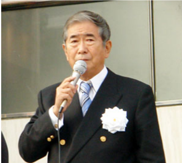
Ishihara Shintarō, the governor of Tokyo

For, the exception here derives from ex capere , meaning “outside,” and a state of exception is a state in which the law makes itself known by suspending itself. This is an effective way to control a population that exists outside ordinary national law.[22] Of course, undesirable elements can include both nationals and non-nationals. The unknowable number of victims in concentration camps in North Korea and the testimonials of those who have escaped attest to this. Yet here, also, the degree of belonging to the nation became manifest in an unmistakable way: returnees to North Korea from Japan were often sent to camps that had been specially reserved for them, marking them out as a distinctly superfluous population, for example.[23]