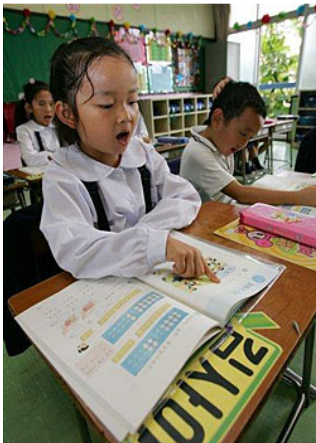
Ethnic Korean students study at a Chongryun-funded

exchange, Chongryun secured relative autonomy to operate its own schools with its own academic curricula. As long as its schools were not accredited as Level 1 schools, or ichijūkyū , those classified by the Ministry of Education as capable of issuing academic certificates and degrees, the pedagogical contents of programs offered at these institutions would be left untouched by the ministry. At the same time, however, Chongryun schools would not be entitled to public subsidies, thereby freeing the ministry from the burden of having to finance the education of Korean students enrolled in Chongryun schools. Chongryun enjoyed substantial support among Koreans in Japan. At the time of its founding, Japanese intelligence estimated that as many as 90 percent of Koreans in Japan sympathized with and supported North Korea.[14]