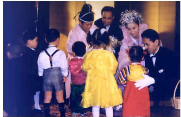
Young Koreans in Japan celebrate wedding in traditional Korean style.

Nevertheless, what the above passage made me wonder—and what I found to be odd in it—was this: Koreans in Japan have always had incorporated class stratification: throughout the colonial period, during the US occupation and the entire post-war period, and to this day. The question is why, then, do some researchers think that class (and here, I take that they mean, through conflation, class consciousness and class differentiation) was not previously relevant to Koreans in Japan or, more precisely, when we think about Koreans in Japan. When did class disappear from the rhetoric and understanding of and about Koreans in Japan to the extent that now someone has to “bring class back in”?