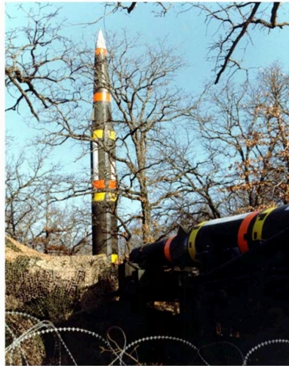
US Pershing Missile

Ten years later, Henry Kissinger called a nuclear alert in the last days of the 1973 Israel-Arab war. The purpose was to warn the Russians not to interfere with his delicate diplomatic maneuvers, designed to ensure an Israeli victory, but a limited one, so that the U.S. would still be in control of the region unilaterally. And the maneuvers were delicate. The U.S. and Russia had jointly imposed a cease-fire, but Kissinger secretly informed Israel that they could ignore it. Hence the need for the nuclear alert to frighten the Russians away. Security of the population had its usual status. 11