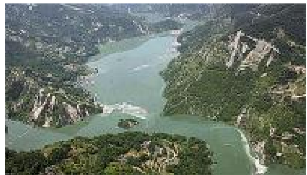
Quake lake bird's eye view