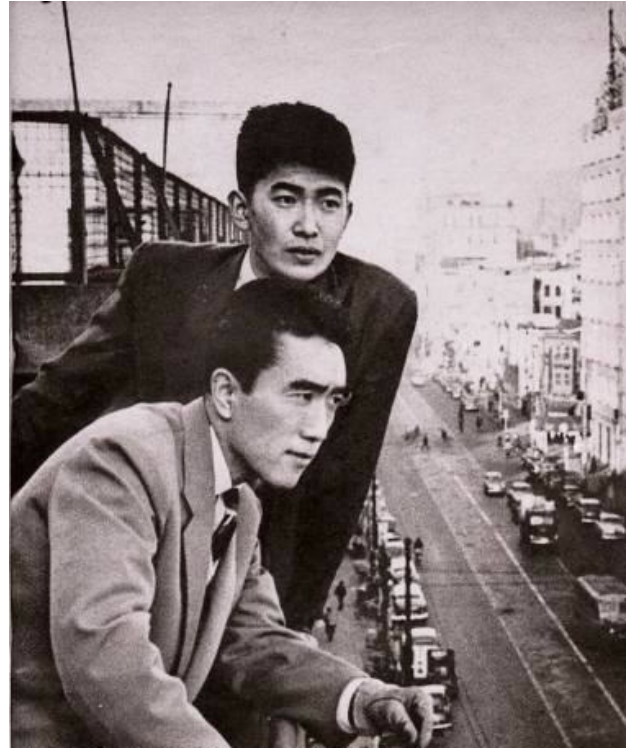
Ishihara Shintaro in 1956 with fellow novelist Mishima Yukio (foreground)

In the mid-1990s, just as social inequality mounted, a relatively small number of influential figures built a classically compensatory cultural nationalist movement, asserting the right to national pride, including an offensive military force, and blaming foreigners for all of Japan's troubles. Ishihara Shintaro, the novelist-turned-politician, epitomised this trend in his 1998 book, The Japanese Economy That Can Say NO! which catapulted to top-ten business-list status. No longer using economic strength as the marker of cultural superiority, Ishihara instead celebrated the belligerency of the wartime state. His call for greater reliance on the market economy is also similar to that of Noguchi Yukio, although Noguchi saw such measures as the path to normalcy and Ishihara believed they would liberate Japanese exceptionalism. [16]