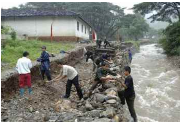
Fighting floods in North Korea in 2007

Big mistake. When heavy rains hit in 1995, this dragooning of marginal lands into agricultural production only amplified the national disaster. The resulting flooding damaged more than 40% of the country's rice paddy fields. Torrential rains washed away topsoil, while rocks and sand, dislodged from hillsides, ruined low-lying fields. The rigid economic structures in North Korea were unable to cope with the triple assault of bad weather, soaring energy, and declining food production. Nor did dictator Kim Jong Il's political decisions make things any better.