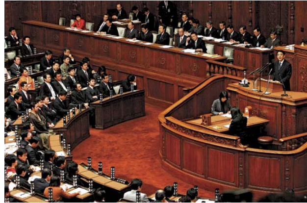
Prime Minister Abe opening the first Diet session of 2007

They now have a two-pronged strategy to meet American demands. In the short term, they hope to secure passage of a permanent law to authorize the overseas despatch of Japanese Self-Defence Forces for "international cooperation activities." That would obviate the current need for a "Special Measures Law" (with attendant Diet debate and inevitable restrictions and conditions) every time the SDF is to be sent on a mission. For the longer term, 239 present and former members of the national parliament joined on 1 May in a new organization, the Diet Members Alliance to Establish a New Constitution. Unlike its predecessors, this Association incorporates prominent members of the opposition Democratic Party of Japan. By thus incorporating the opposition, the revision requirement of a two-thirds parliamentary majority becomes feasible.