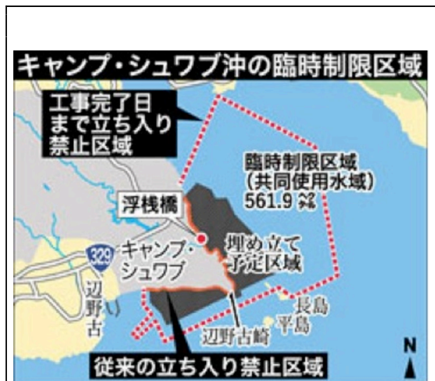
The Oura Bay Maritime Exclusion Zone (dotted red line) and the planned construction site (dark coloured) extending into the sea around the existing Camp Schwab Marine base. Henoko fishing port is marked at bottom left, beneath the “329” sign

confines of the existing Camp Schwab base and declaring an exclusion zone covering just over half of Oura Bay (561 hectares) preparatory to undertaking the reclamation. This maritime zone stretched the existing 50 metres exclusion zone around Camp Schwab to over two kilometres from the shoreline. Within that zone, 160 hectares of sea fronting Henoko Bay to the East and Oura Bay to the West were to be reclaimed and a mass of concrete to be imposed upon it, towering 10 metres above the surrounding sea and containing two 1,800 metre runways, a deep-sea 272 metre long dock and a complex of other facilities to be imposed upon it. Steamrolling the Okinawan people’s consistently expressed opposition, and without consultation or even prior notice, the Abe government appropriated half of one of Japan’s most precious nature zones for the construction of an American super base.