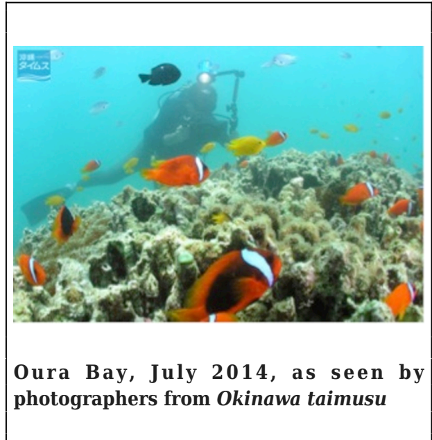
Oura Bay, July 2014, as seen by photographers from Okinawa taimusu

environmental assessment). 8 In mid-2014, Abe let it be known that he was contemplating dispatch of the same warship to the same Northern Okinawan waters. 9 This time it seemed the deployment would be overt. Determined not to allow any ambiguous or humiliating (to the state) outcome, he would mobilize all available forces.