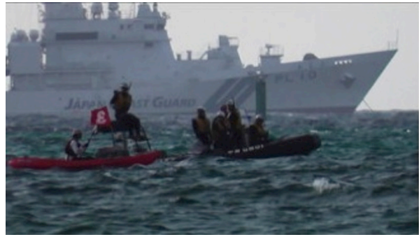
Anti-base canoeists vs the Japanese state’s Coastguard ship on Oura Bay

Between 1996 and 2014, non-violent Okinawan resistance at Henoko blocked all attempts at base construction. Through the democratic means open to them – resolutions of village, town, and prefectural representative bodies – Okinawans had made their opposition clear, culminating in the January 2013 Kempakusho and in the Nago City elections of January 2014 in which the anti-base Inamine Susumu was re-elected by a substantial margin despite a massive Tokyo campaign to unseat him. Governor Nakaima’s submission notwithstanding, therefore, base construction could only proceed by overruling the opposition of the Okinawan people, which meant in particular the opposition of Nago City and its mayor.