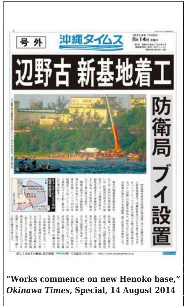
“Works commence on new Henoko base,” Okinawa Times, Special, 14 August 2014