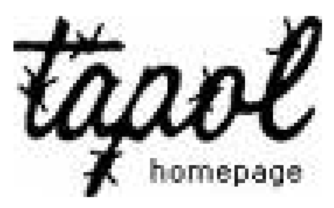
Tapol. The Indonesia Human Rights Organization

Justice is also the expectation of civil society groups inside both Timor-Leste and Indonesia. It is also the expectation of the international human rights community (London-based TAPOL is an exemplar of civil society concern in both East Timor and Indonesia over the decades). Inside Indonesia, for example,