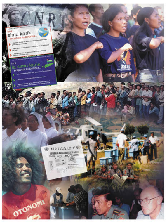
Konsulta Populár Popular Consultation 30 Agustu 1999

Comissão de Acolhimento Verdade e Reconciliação de Timos-Leste suppressor importante o