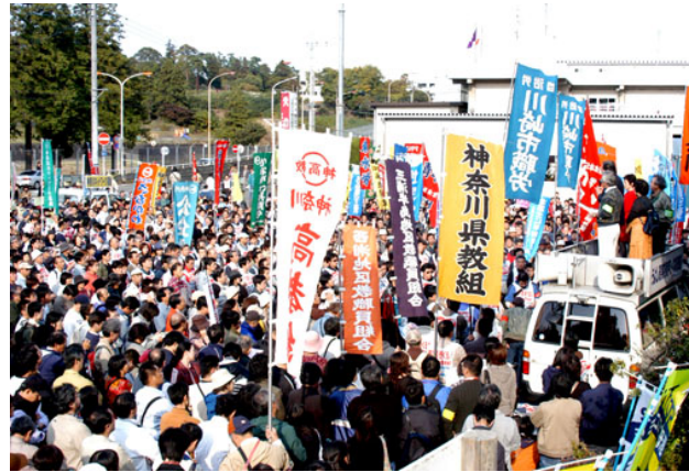
Protest against base reorganization plan outside Camp Zama in 2005

1) Zama, on Tokyo’s southern outskirts, was designated as the HQ of US forces in Japan and prospective site for relocation of the US 1st Army HQ from Fort Lewis in Washington State. At present Zama City is the sole local district penalized for non-cooperation under the under the 2007 law for facilitating the reorganization of US Forces in Japan. The mayor of Zama, who has sworn that he will stand firm even if the government (Japanese, US, or both) were to target him with a Cruise missile, faces election for a 7th term in August 2008.