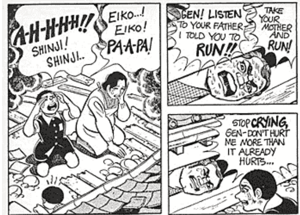
Gen's father's death

grader. Back then, school evacuations began with third grade. I envied him, thinking that if you went to the countryside, you'd probably be able to eat your fill. But a letter came, and in it he moaned that he was getting thinner and thinner and please send soybeans. So I heard Dad say more than once, "I wonder if we should bring him back." It was just before the atomic bomb. Had Dad brought him back, they'd have died together in the atomic bombing. Even if you went to the countryside, you couldn't eat your fill: I realized that keenly.