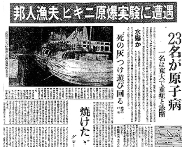
Yomiuri newspaper reports on the Lucky Dragon #5, March 16, 1954