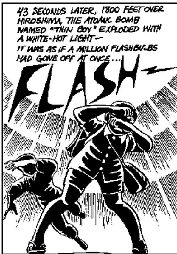
The atomic bomb explodes