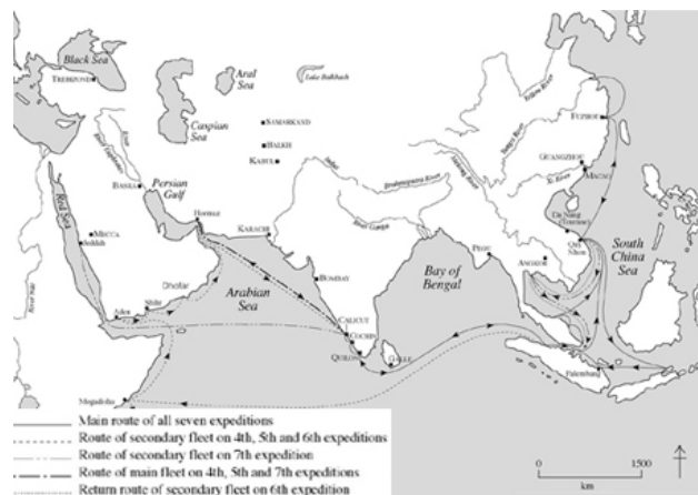
The routes of Zheng He's expeditions

Indeed, even China's “tribute trade”—the scope of which Zheng He's expeditions sought to expand and the Ming subsequently curtailed—had greater economic costs than benefits. Ever since the establishment of a unified taxation system under the Qin and Han dynasties more than a thousand years earlier, tributary relations between the Chinese imperial court and vassal states did not involve the collection of a tax. On the contrary, especially after the Tang dynasty, and with the sole exception of the Yuan dynasty, vassal states offered the Chinese imperial court only symbolic gifts and received in return much more valuable gifts. Thus, what was nominally “tribute” was in fact a two-way transaction which enabled the Middle Kingdom to “buy” the allegiance of vassal states, and at the same time to control flows of people and commodities across its far flung frontiers. [26]