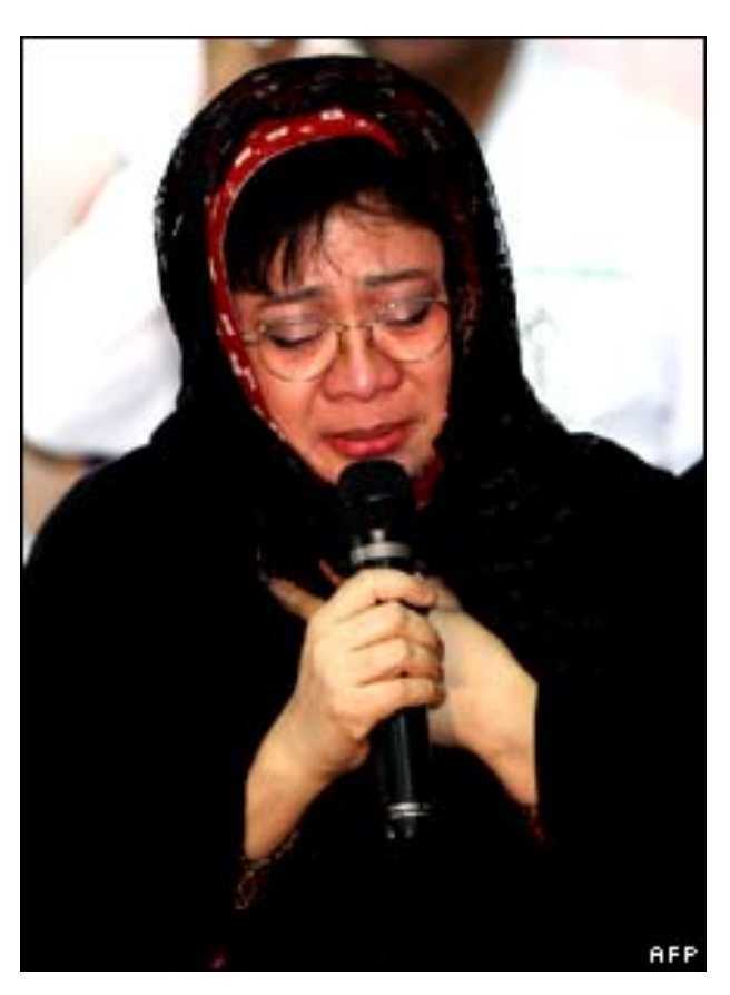
Suharto's daughter begs people to forgive her father for human rights abuses and corruption