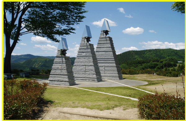
Sculpture at the Yaotsu Memorial representing visas

While Sugihara’s family and others were crafting Sugihara’s memory by writing, in the early 1990s his hometown, Yaotsu, decided to give his memory a more three-dimensional aspect. They set the wheels in motion to create a memorial place and time [2] for him. Within a few years a memorial site—consisting of a monument and a small memorial hall dedicated to Sugihara and his story—was built on a hill in town. Naming it the Hill of Humanity, and constructing a large park, the planners invited visitors to remember Sugihara by the catchword of humanism [3].