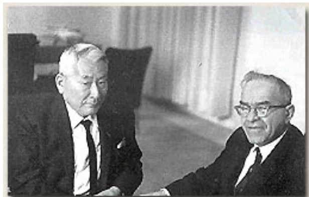
Jerusalem, 1968: Reunion of Chiune Sugihara, left, and Zorach Warhaftig, Israeli Religious Minister and a Sugihara survivor.

The Japanese life story of Sugihara Chiune would contain yet another unexpected development. In 1968, Sugihara's past caught up with him. One of the Jewish refugees he had saved by issuing the transit visas—an Israeli civil servant—located him. In 1969, the Israeli Minister of Religion—another refugee saved by Sugihara's visas—invited him to Israel and awarded him the Israeli Ministry of Religion Prize for his actions during the war.