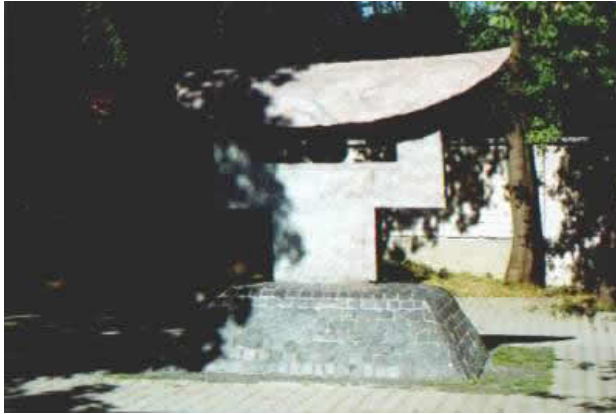
Sugihara Memorial in Vilnius, Lithuania