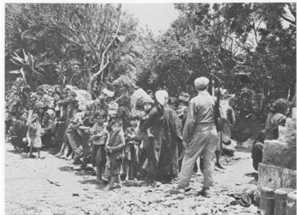
FIGURE 81.—Civilians of Okinawa, casualties from the battle areas, await their turns at the military government medical aid station, Gushikhan, Okinawa, June 1945.

The enormous sacrifices on both sides in this battle, including an approximate total of 200,000 dead[35], seem particularly outrageous to Okinawans because the Japanese military had decided six months earlier to abandon the prefecture as a “throw-away stone”( sute-ishi ), a piece which is sacrificed, like a pawn, in the game of go. Okinawan civilians, including schoolchildren, were mobilized for a protracted war of attrition that Japan's military leaders hoped would inflict high American casualties, slowing the Allied advance, and buy time to prepare for an anticipated invasion of the mainland. They also hoped that high American casualties would lead the U.S. to accept surrender terms more favorable to Japan rather than risk an invasion of the Japanese main islands.