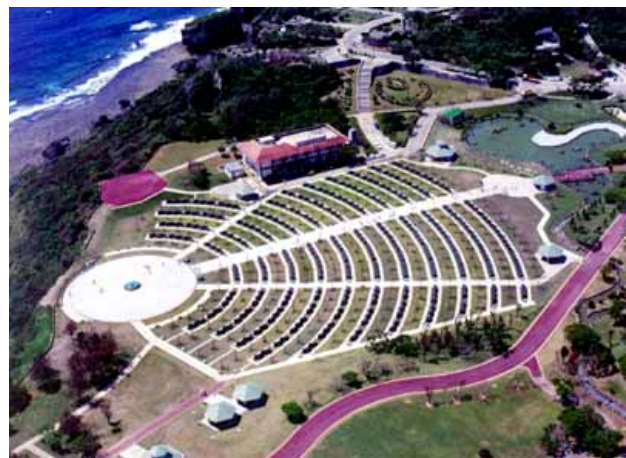
Cornerstone of Peace Memorial to Battle of Okinawa

Published in 1996, the program guide for the Okinawa Prefectural Peace Memorial Museum explains, "These deaths must be viewed in the context of years of militaristic education which exhorted people to serve the nation by 'dying for the for the emperor' ( Tenno no tame ni shinu )." [4] Okinawans cite the role of emperor-centered indoctrination of unquestioning self-sacrifice not only in compulsory group suicides, but also in many other deaths among the more than 120,000 local residents who lost their lives in the only Japanese prefecture subjected to ground fighting. [5] They also point to recently released documents showing that the Battle of Okinawa could have been avoided if the Showa emperor had not decided in early 1945 to prolong the war, rejecting the advice of former Prime Minister Konoe Fumimaro to end it immediately. [6]