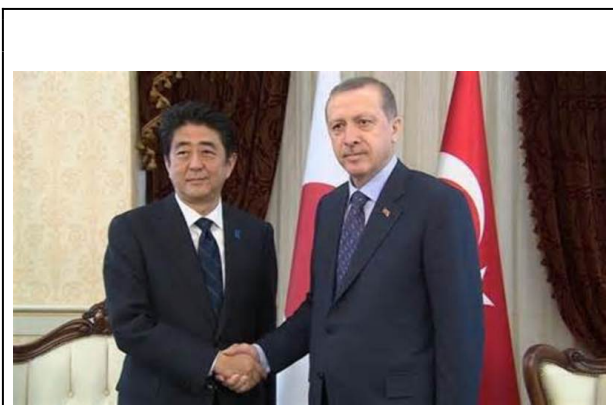
PM Abe Clinches $22 bn Nuclear Deal with Turkish PM Erdogan

exports of nuclear power plants. Toshiba owns 87% of Westinghouse while Hitachi and Mitsubishi have tie-ups with GE and Areva meaning that Japanese firms are major players in nuclear energy. Abe has become an active pitchman for Japanese nuclear technology, but if Japan begins phasing out its nuclear reactors, potential clients might look elsewhere. Abe's growth strategy calls for tripling infrastructure-oriented exports to $300 bn by 2020, and nuclear technology exports are key to achieving this target. Earlier this year Japan (with French companies) secured a long-term $22 billion contract with Turkey (a quake prone country). It has also signed a nuclear technology agreement with the United Arab Emirates and is eyeing sales to Brazil and Saudi Arabia. Negotiations are also ongoing with India to enable Japan to sell its technology there and Abe lobbied hard on behalf of Japan's nuclear exporters at a June 2013 central European summit of the Visegrad countries (the Czech Republic, Hungary, Poland and Slovakia) He also signed an agreement with France in June 2013 to deepen cooperation on nuclear exports. (The Diplomat 7/3/2013)