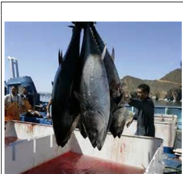
Fukushima's fishermen wonder if they will ever be able to resume their livelihood

The fundamental problem is that large volumes of groundwater flow from inland mountainous areas, passing through the seaside Fukushima facility and thus become contaminated by water being used to cool the reactors and radioactive water that has accumulated in underground trenches before entering the ocean. In late 2011 Tepco and the government