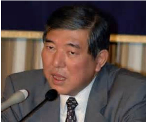
Ishiba Shigeru, LDP Secretary General, wants to keep the nuclear bomb option open