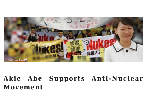
Akie Abe Supports Anti-Nuclear Movement

expertise while 24% are in favor. Even within the LDP, opponents (43.2) exceed supporters (40.4) of nuclear exports. (Japan Times 6/13/2013) The export sales drive is being ramped up even as 150,000 people remain displaced from their houses due to the Fukushima accident. Abe faces further opposition to his nuclear energy plans on the domestic front as his wife also opposes nuclear exports. She said, "It will be better to use part of the money spent on nuclear plants for the development of new energy and promote the sale of Japanese-born clean energy overseas." (Asahi June 11, 2013)