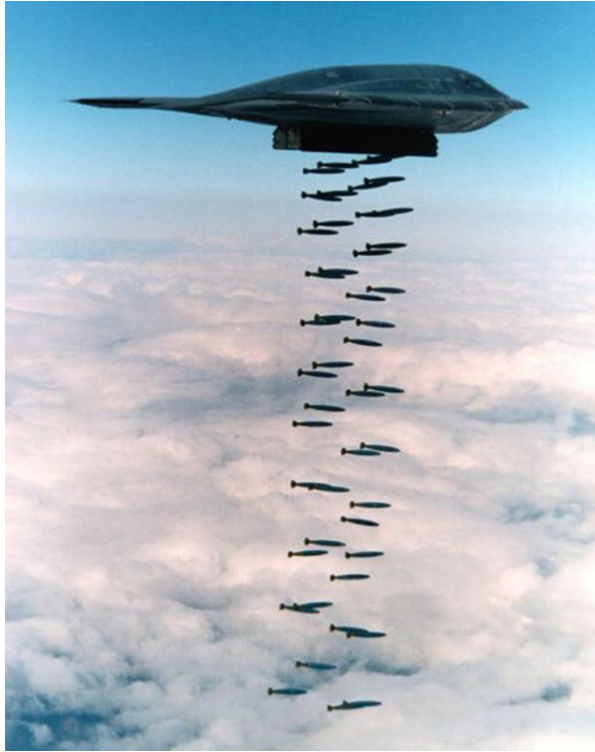
B2s dropping inert munitions