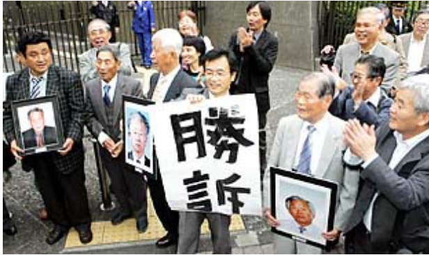
Outside the Japan Supreme Court on November 1, 2007, supporters of Mitsubishi Korean forced laborers celebrate the plaintiffs' success in winning belated compensation for exposure to the Hiroshima atomic bomb. Chugoku Shinbun, Nov. 2, 2007.

What is astounding about the decision of November 1 is that it has taken so long to be finalized. The Health and Welfare Ministry's instruction in 1974 to local governments that benefits be restricted solely to hibakusha living in Japan in fact had no basis in the original 1957 "A-bomb Survivors Medical Care Law," which defined those eligible solely as "atomic bomb survivors," without any further stipulations of residence or nationality.[2]