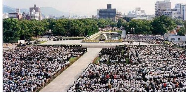
The annual August 6 ceremony in memory of those who died and have suffered from the 1945 atomic bombing of Hiroshima.

Government-to-government consultations are currently under way between the Japanese and South Korean governments. These include jointly inspecting sites in Japan where Korean conscript remains reside and extending the systematic return of remains to South Korea that began in January 2008; convening conferences concerning the Financial Deposits Names List of Korean conscripts’ unpaid wages and national pension contributions, currently held by the Bank of Japan; and Japanese government partial funding of pilgrimage-style visits by Korean family members to former South Pacific battlefields where conscripted relatives were killed, which continues previous Japanese government cooperation with returning remains.[20]