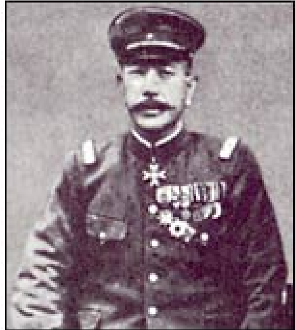
Gen. Ishii Shiro led Unit 731, Japan's chemical warfare operation in China during World War II. Ishii and those associated with him provided the U.S. with information about their experiments in exchange for immunity.

"no heads of the dreaded Kempeitai (the military police) were indicted; no leaders of ultranationalistic secret societies; no industrialists who had profited from aggression and had been intimately involved in paving the 'road to war.' The forced mobilization of Korean and Formosan colonial subjects was not pursued as a crime against humanity, nor was the rounding up of many tens of thousands of young non-Japanese who were forced to serve as 'comfort women' providing sexual services to the imperial forces." [18]