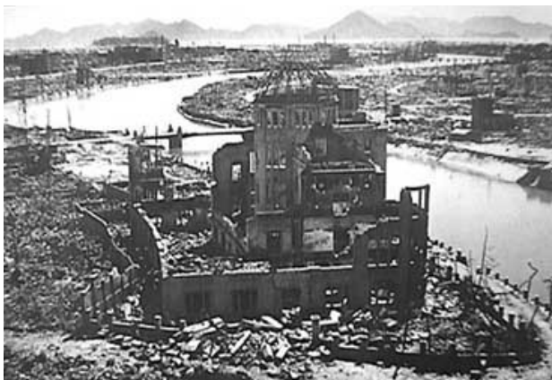
Hiroshima's atomic dome and vicinity after the atomic bombing

Finally, the full impact of the atomic bombings of Hiroshima and Nagasaki by the U.S. - from 1945 to the present - must be addressed. The massive incendiary bombing of Japanese cities, causing the deaths of hundreds of thousands of civilians, was a "crime against humanity" as was the massacre of thousands of Chinese by Japanese forces in places like Nanjing. However, a legacy unique to the atomic bombings is the persistence of radiation sickness, that is visible even today among surviving hibakusha. The U.S. not only claimed that Hiroshima was a "military base" (President Truman's radio address), but subsequently denied that there was a persistent danger of radiation beyond the immediate gamma radiation released at the time of the blast. The damage that the U.S. did to so many people - Japanese, Koreans, Chinese, Allied POWs - who were in these cities at the time of the bombings and immediately afterward must be acknowledged. These were two unique events in history that serve as a warning of the full catastrophe of nuclear war. An apology by the U.S. is long overdue.