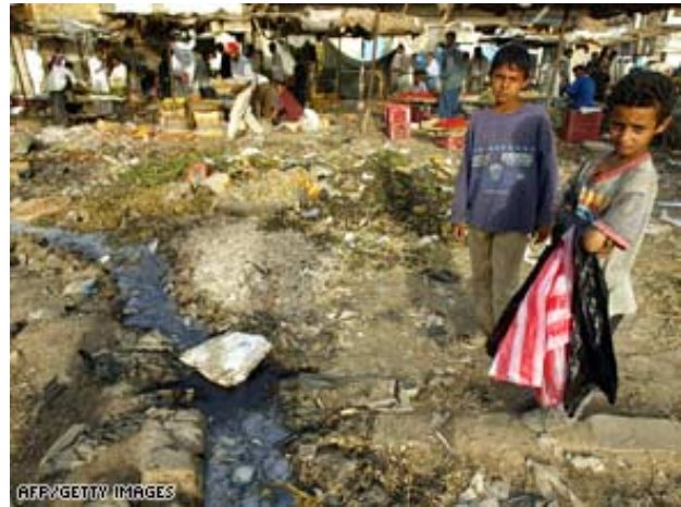
Cholera cases reached 2,000 in 2007 according to the UN

chemicals for water purification from Iran by corrupt officials. Everybody talked about the cholera except in the Green Zone where people had scarcely heard of the epidemic.