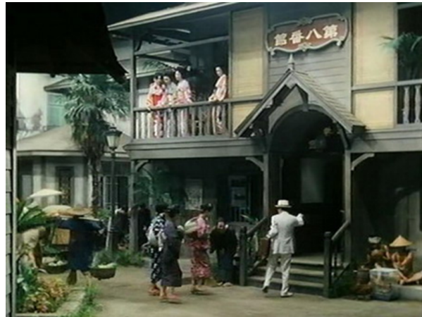
Karayuki in film. Sandakan 8.

The work of such agents, which involved canvassing people in one place and transporting them by sea over great distances to another destination, has been documented in the (sensationalist and unreliable) biography of Muraoka Iheji dealing with his role in shipping Japanese women across Southeast Asia through international networks of “slave-trading.” 32 The feminist inspired writings of Yamazaki also focus on the procurer and justifiably point out the significance of this agency whereby men and women were bound up in relations of power in which women were dominated, highlighting the effects of the subordinate position women were placed in.