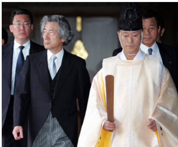
Prime Minister Koizumi at Yasukuni Shrine, August 15, 2006

inside Japan. Yasukuni is another example. I have argued already for more than two years that there is a need to introduce some fundamental reform to Yasukuni, and while this reform is proceeding, prime ministers should impose a moratorium on their visits. Since Koizumi's visit to Yasukuni on August 15, 2006, no prime ministers have visited, but no reform has been introduced. Should this reform be introduced, it may entail some political row from fundamentalists. That row itself might prove to be provocative to the Chinese and Koreans, reminding them of their haunting historical memories. But then, could the Japanese just leave the Yasukuni issue in today's suspended situation, where the Emperor's visit is de facto prohibited and prime ministers are at best put under a moratorium? In my view, this domestic contradiction must be overcome.