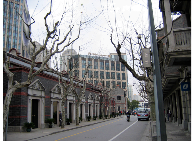
Site of the First Party Congress; author's photograph 2007.

Shanghai Hongse Luyou [A Red Tour of Shanghai], 2005