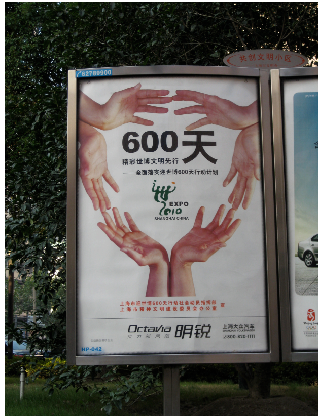
One of several different posters seen by the author in Shanghai in November 2008 that drew attention to the days left until the May 1, 2010, start of the World Expo

This was celebrated via banners and slogans that festooned the large store’s outer walls and by means of an eye-catching outdoor display of artifacts from the past—a vintage car, a rickshaw, an old tram—that encouraged tourists and locals to imagine that they had stepped back in time to the days when Sun Yat-sen met John Dewey and the opening of the latest Charlie Chaplin film was the talk of the town.