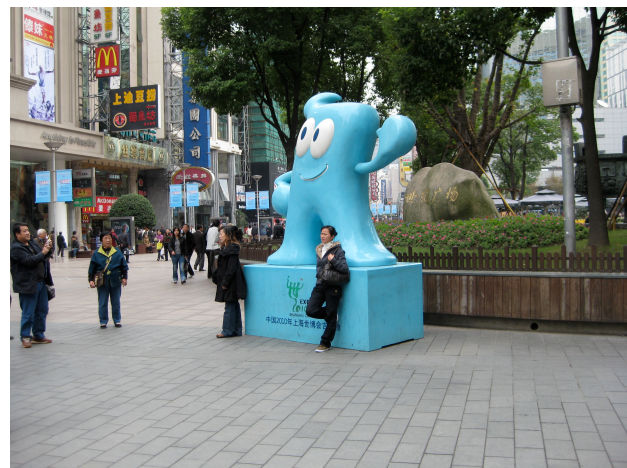
A statue of "Haibao" on Nanjing Road, between the May 30th plaque and the May 30th monument; author's photograph 2008.