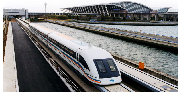
The Maglev train, with the Pudong Airport in the background.

Twenty years ago, while some guidebooks in Western languages presented Shanghai's allure as tied to its glamorous treaty-port era incarnation as a cosmopolitan “Paris of the East,” the ones in Chinese simply took it for granted that the city's importance lay in its contributions to the Revolution. No Chinese reader needed to be reminded then that Shanghai had a “red” side. The treaty-port era was presented in domestic guidebooks of the time as a period of humiliation, when Chinese were treated as second-class citizens within a part of their own country and evil imperialists exploited the local population.