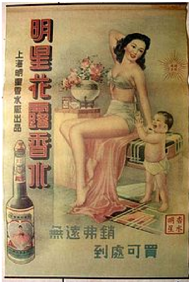
A Shanghai advertisement ca. 1930 for perfume; the nostalgia craze has spurred a

And nostalgia for Old Shanghai focuses on "blue" visions of a pleasure-mad, stylish, money-fixated city, where saxophones always played, the latest Hollywood movies were always showing (and stars like Charlie Chaplin sometimes passed through), and the neon never went out.