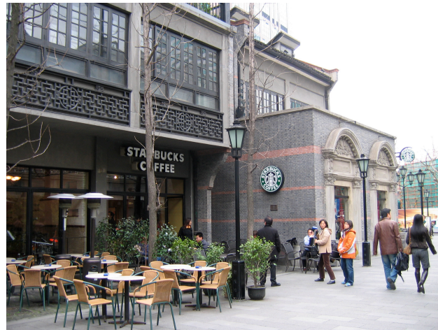
The Starbucks at Xintiandi; author's photograph 2007.

large market for reproductions of calendar girl and ad shots like this one.