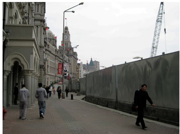
"Big Ching"; author's photograph 2008.

The goal of the guidebook quoted from above is to encourage Chinese spending time in Shanghai to focus on visiting its "red" sites. That is, it steers them toward places with clear ties to the revolutionary past, such as the