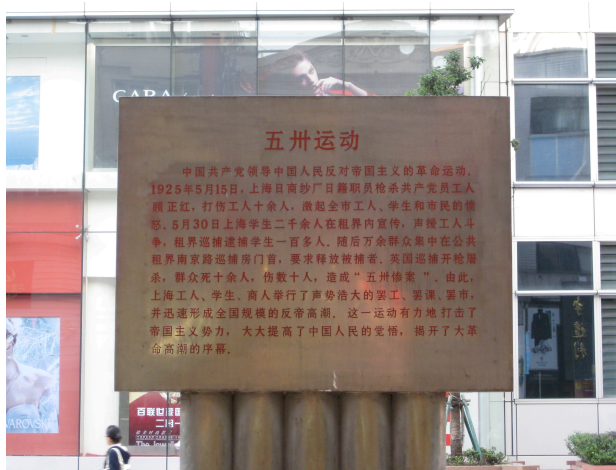
A plaque on Nanjing Road commemorating the May 30th Movement; key marches in the struggle took place on this boulevard

Another attraction was the ready availability of foreign products. For those who had developed a taste for Russian borscht, French bread, Austrian pastries, or Japanese sashimi, Shanghai was a very good place to live. Similarly, for those who liked to read Dickens or Zola, Molière or Marx, and to keep up with new work that was being written in Japan or translated into Japanese, Shanghai was the best Chinese city in which to reside.