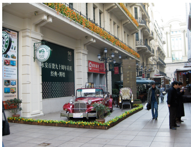
Streetside display, just off of Nanjing Road, evoking an early era in the Wing On store's

Shanghai, to people of the sort just described, whether or not they were Marxists, was an alluring place to live for many reasons. One attraction of the metropolis was purely pragmatic. The division of the city into two international jurisdictions and a Chinese municipality meant that if one’s activities (say, publishing a radical newspaper) attracted the attention of a given police force, one could easily move to another district and go on with what one had been doing.