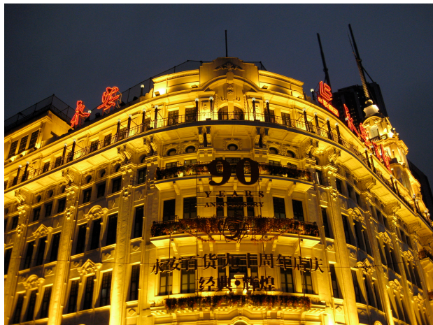
The Wing On Department Store on Nanjing Road marks its 90th anniversary; author's photograph 2008.

Qu, who spent the mid-1920s teaching at Shanghai University (the most radical local educational institution), was one of the first leaders of the Chinese Communist Party. He had gained fame early within radical circles, thanks to going to Russia right after the Bolsheviks took power and sending back a series of positive reports on life in the new system that were published in China. He also got a chance to meet Lenin himself while abroad. Qu, who developed a reputation as a suave dresser and generally something of a dandy, regularly contributed political articles to Xin Qingnian (“La Jeunesse” or “New Youth”) and other CCP periodicals such as Xiangdao Zhoubao (the Guide Weekly).