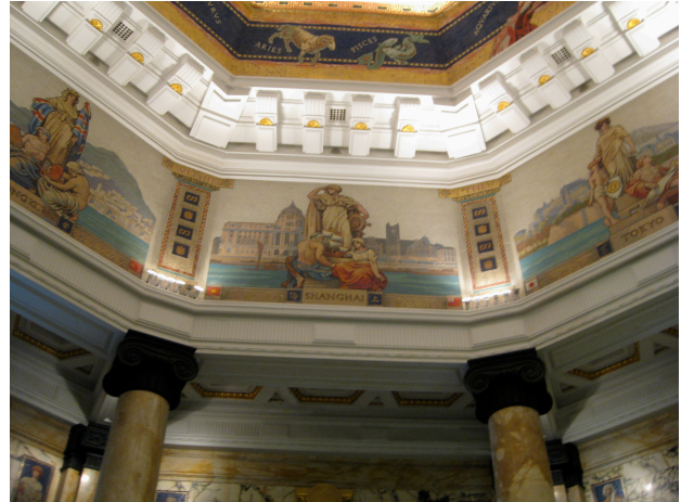
Mural inside of the Hongkong and Shanghai Bank Building (now the Pudong Development Bank).

What intrigues me about the book, as someone who first started spending time in Shanghai in the 1980s, is that the author thinks it necessary to convince Chinese readers that the city isn't just a place known for its “blue” sites built in the early 1900s—places such as the neo-classical Custom House (with its giant clock nicknamed “Big Ching” that was manufactured in England and shipped to China with great fanfare) and the domed Hongkong and Shanghai Bank Headquarters (once the largest bank building in the world) that evoke the port's historic ties to international fashions, international finance, and Western lands across the sea.