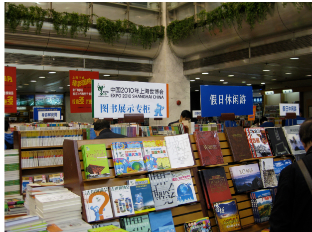
The special "Expo" section of a large bookstore ("Book City" on Fuzhou Road); author's photograph 2008.

have become impossible to avoid on a walk through the city, especially since they are plastered on so many of the walls to the urban center’s hundreds upon hundreds of construction sites.