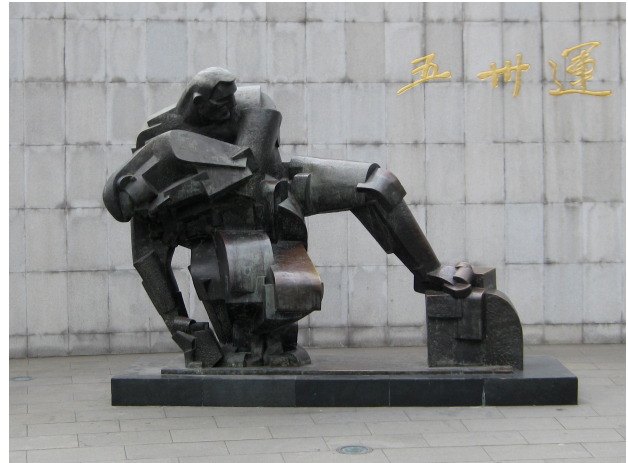
Statue honoring the "red" workers and martyrs of 1925; author's photograph 2008.

sponsored by local publishing houses and other groups that was attended by more than 1,200 people.