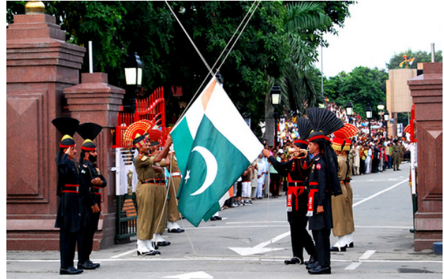
Ceremonial changing of the Pakistani guard at the Wagah India-Pakistan Border

Any proven involvement by Pakistani state institutions in the Mumbai attack would be a calamity for Pakistan-India relations and, by extension, America's strategy for South Asia.