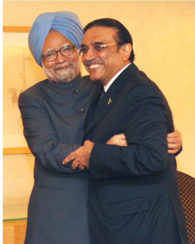
Manmohan and Zardari

First, there was a bizarre kaffuffle over an allegedly threatening call from India’s Foreign Minister, Pranab Mukherjee, to President Zardari, demanding action on the anti-terrorist agenda “within 48 hours”. Secretary Rice tried to defuse the situation by passing the message to Pakistan that the phone call was a hoax.