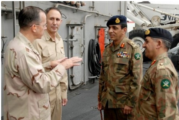
ISI head Maj. Gen. Ahmad Shuja Pasha (right) with Chairman of the US Joint Chiefs of Staff, Adm. Mike Mullen (left) in an August 27, 2008 meeting.

On November 28, Indian Prime Minister Manmohan Singh asked his Pakistani counterpart Yousuf Raza Gilani to dispatch the Director General of ISI, one Lieutenant General Shuja Pasha, to India to receive Indian findings concerning the TeL links of the attackers and “share information”.