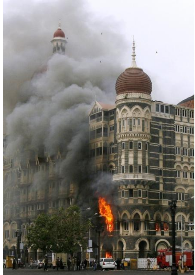
The Taj Mahal Hotel in flames

However, after the initial shock of the Mumbai attack wore off in Pakistan—and the international narrative that the attackers were Pakistani coalesced—there was an immediate and emotional rejection of the idea that long-suffering Pakistan should be further destabilized under U.S. and Indian insistence that the miscreants be pursued inside Pakistan's borders.