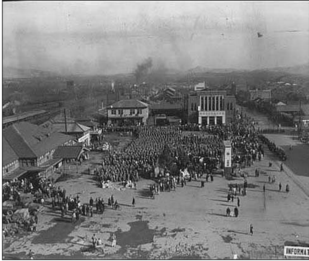
Daegu railway station, 1950

This event was part of a momentous development in postwar Korea, in which villagers and townspeople across South Korea began assembling in public spaces to demand justice for their relatives killed unlawfully before and during the Korean War. In 1960, South Koreans experienced a brief period of political democracy after student-led protests brought down the US-backed postwar regime of Syngman Rhee. Immediately after the democratic revolution, a number of local associations of bereaved families were established, which soon expanded to a national assembly of the families of the victims of the Korean War civilian killings. Some of these local associations took the initiative to open the mass graves of the victims. The associations reburied the remains of their relatives and held collective death-commemorative rites at the new collective tombs. The National Assembly of Bereaved Families hoped that the parliamentary inquiry would change the status of their relatives from collaborators with communism to victims of state violence.