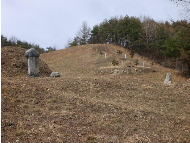
Miryang graveyard closeup

hundred ancestors? What happened in their genealogical history that their lineage has fallen to the current anomalous situation of minimal existence?