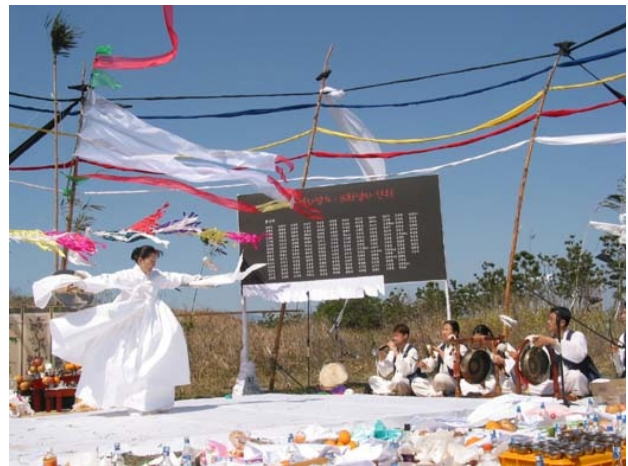
Rite of spirit consolation, Jeju

the government had earmarked before the war as communist sympathizers or potential collaborators with North Korea. An estimated one hundred thousand civilians are believed to have been killed by this extraordinary state-of-emergency measure taken in the first few weeks of the Korean War. The dead included inmates of national and provincial prisons, who were held there on charges of political crimes relating to the social unrest and political conflicts of postcolonial Korea since the nation’s liberation from Japan’s colonial rule in August 1945 at the end of the Pacific War and the subsequent division of the nation between the Soviet-occupied north and the US-occupied south.