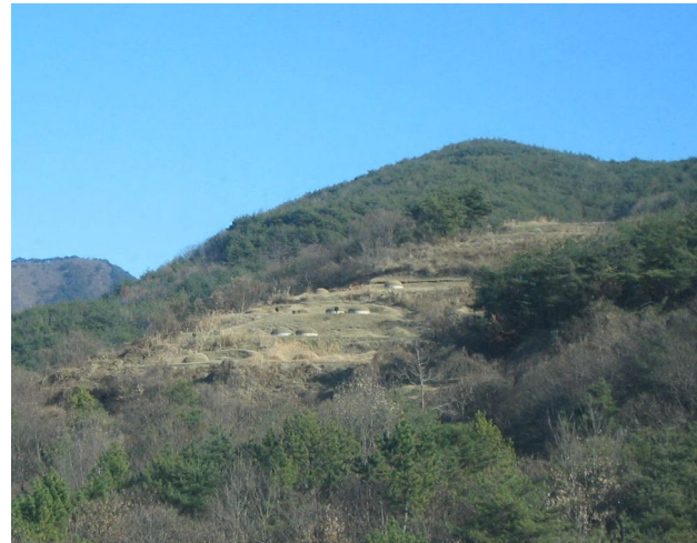
Miryang communal graveyard

On a gentle hillside on Jeju, a communal graveyard has a unique name and history. Surrounded by the reed fields that abound on this beautiful island near the southern maritime border of Korea, the gravesite consists of a large stone-walled compound, where one hundred and thirty-two modest, well-tended grave mounds lie in neat lines, and a tall stone-made memorial stands in the middle of the compound. Visitors can easily recognize that it is no ordinary graveyard. The site is distinct from the stone-walled individual or family tombs familiar to the island population, or from the traditional family ancestral graves commonly found on the hills of mainland Korea. There are simply too many graves concentrated in one place in this graveyard, and moreover, none is marked by the usual gravestone or a stone tablet, where visiting relatives can place offerings of food and alcohol for the dead according to the traditional custom of commemoration. The graves here are nameless, and they stand in a strangely ordered fashion, in tidily organized rows—an organization that people would expect to see in a military cemetery, not in a village graveyard.