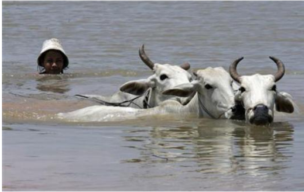
A woman guides bulls to higher ground in the Mekong near Phnom Penh

The larger cost has been diplomatic, as downstream neighbors suspect rightly or wrongly that Chinese dams were primarily responsible for the flooding. From the hard-hit Chiang Saen and Chiang Khong districts of Thailand's northern Chiang Rai province to its eastern Mukdahan province, many Thais believe waters released from the reservoirs of three upstream Chinese dams swelled the runoff from heavy rainfalls. They also blame China's recent blasting and dredging of upstream river rapids to make the river navigable for large cargo vessels for rising water levels.