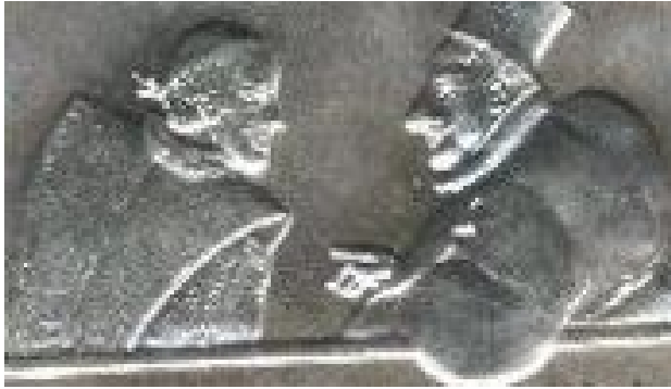
Oda Nobunaga and Frois