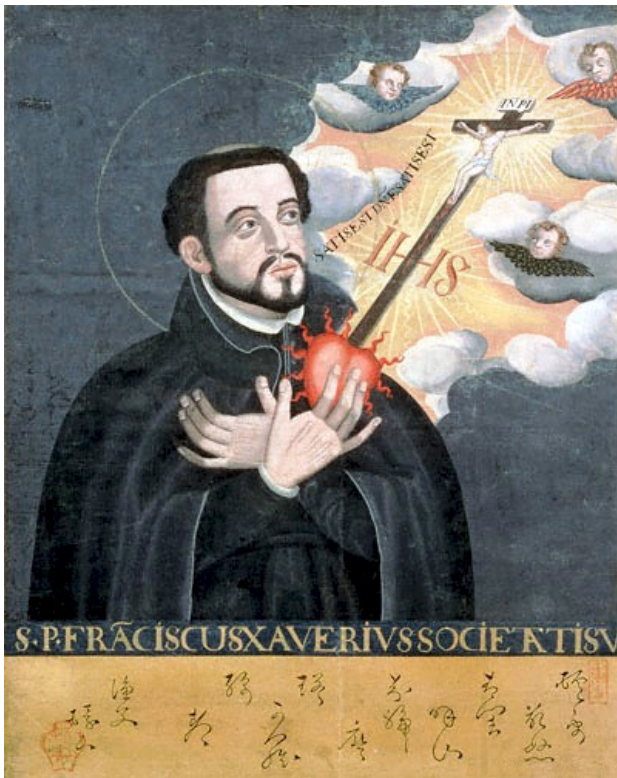
Japanese portrait of Francis Xavier

In 1581, in the capacity of interpreter, he accompanied Visitor General Alessandro Valignano on the latter's travels in Japan, and was welcomed in Kyoto and Azuchi by Nobunaga. Nobunaga died the following year.