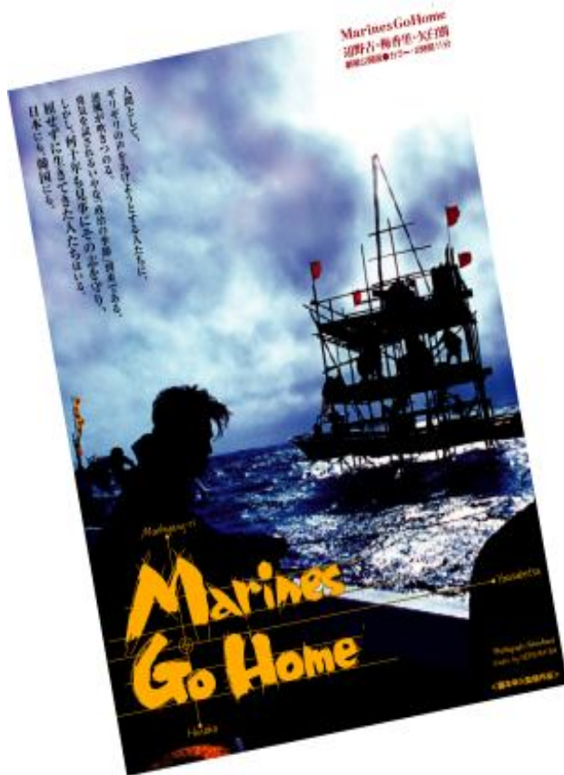
Publicity Poster for Marines Go Home

As the photo below indicates, Nelson’s talk had been “standing room only.” According to main organizer Chika, the audience had exceeded expectations. People were asked to fill in a questionnaire about Nelson’s talk. Of the about 240 people who attended, 131 returned the questionnaire. The high return rate was indicative of the interest generated by the talk.