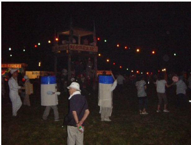
Photo of Heiwa Bon-odori