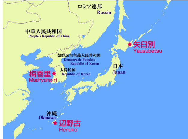
Locations of Yausubetsu, Henoko and Maehyang-ri

Dancing). The section on Maehyang-ri documents the village’s successful campaign to prevent an island just offshore being used for target practice by artillery, aircraft and helicopters. The live-fire range was shut down in August 2005. The section on Henoko showed anti-base activists canoeing out to rigs in Henoko Bay to prevent survey work in preparation for the construction of a new base. In Henoko, anti-base activists have teamed up with environmentalists because the proposed base site is an important habitat for the endangered marine mammal the dugong. The fight to prevent the Henoko project is ongoing in 2008. [6]