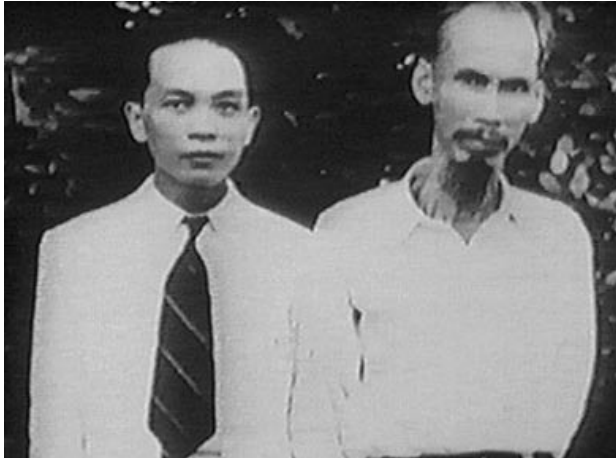
Vo Nguyen Giap and Ho Chi Minh

The asymmetry of their forces with Nato's may be even greater than with the respective sides in Vietnam (even if the alliance pleads shortages of helicopters and other equipment). Yet the recent experience of the anti-Soviet struggle, the emergence of a new generation of military commanders, and - perhaps above all - the mobilisation of centuries-old memories of opposition to foreign occupations, are potent weapons in the Taliban armoury.