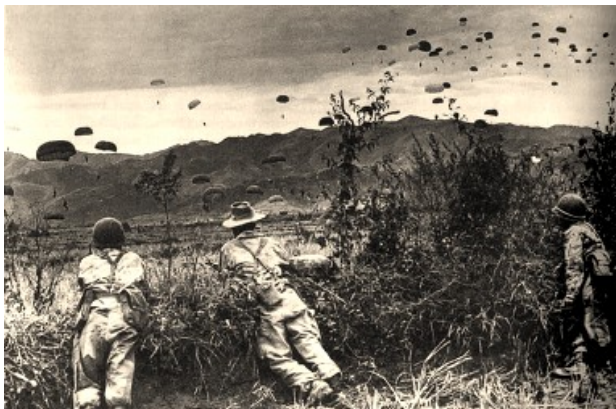
French airborne assault to defend Dien Bien Phu

It was a move too far. The French did not have the resources to supply Dien Bien Phu by air; the Vietminh controlled the access routes, and mounted an epic effort to transfer supplies (a huge amount of them by bicycle) across densely forested and mountainous tracks to encircle and besiege the French forces.