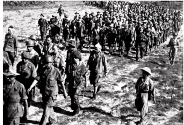
French forces surrender at Dien Bien Phu

French gave up in the face not just of "external" pressure and setback but of an "inner" corrosion of their resolve.