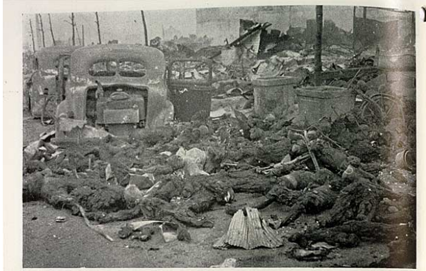
Photo 43.—Japanese photo showing bodies of people trapped and burned as they fled through a street during the attack of 9-10 March. Note that automobiles and bicycles were also trapped and burned.