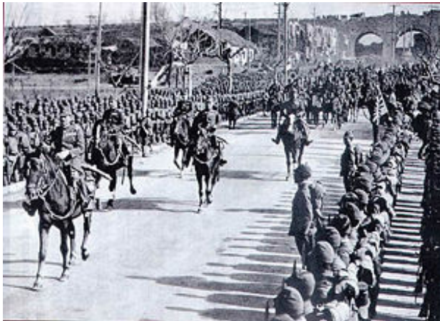
Gen. Matsui enters Nanjing

carrying 30-60 kilograms of equipment, they also faced ruthless military discipline. Perhaps most important for understanding the pattern of atrocities that emerged in 1937, in the absence of food provisions, as the troops raced toward Nanjing, they plundered villages and slaughtered their inhabitants in order to provision themselves. [7]