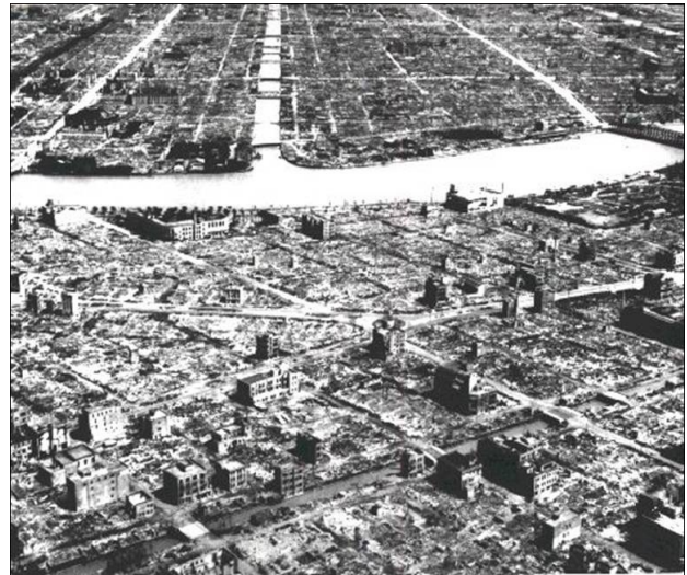
Tokyo after the firebombing

was to reduce the city to rubble, kill its citizens, and instill terror in the survivors. The attack on an area that the US Strategic Bombing Survey estimated to be 84.7 percent residential succeeded beyond the planners’ wildest dreams. Whipped by fierce winds, flames detonated by the bombs leaped across a fifteen-square-mile area of Tokyo generating immense firestorms.