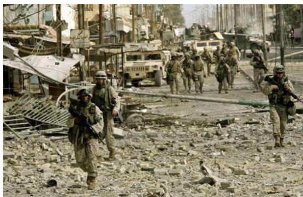
Destroying Fallujah in order to save it

In Iraq, the US military, while continuing to pursue massive bombing of neighborhoods in Fallujah, Baghdad and elsewhere, has thrown a cloak of silence over the air war. While the media has averted its eyes and cameras, air power remains among the major causes of death, destruction, dislocation and division in contemporary Iraq. [28]The war had taken approximately 655,000 lives by the summer of 2006 and close to twice that number by the fall of 2007, according to the most authoritative study to date, that of The Lancet. Air war has also played a major part in creating the world's most acute refugee problem. By early 2006 the United Nations High Commissioner for Refugees estimated that 1.7 million Iraqis had fled the country while approximately the same number were internal refugees, with the total number of refugees rising well over 4 million by 2008. [29] Nearly all of the dead and displaced are civilians.