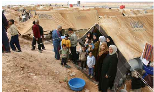
Iraqi refugees on the Syrian border

array of military bases to permanently occupy that country and anchor American power in the Middle East, as the war enters its sixth year there is no end in sight to US warfare in Iraq and throughout the region. [30] Indeed, as the presidential debate makes clear, there is little prospect of exit for the US from an Iraq located at the epicenter of the world's richest oil holdings, regardless of the outcome of the election. It is of course a region in which the geopolitical stakes far exceed those in Korea or Vietnam.