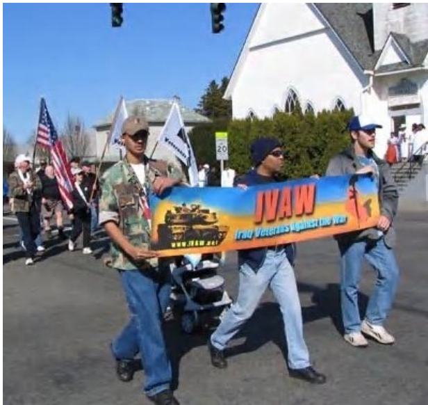
IVAW prepare for Winter Soldier 2008

new electronic and broadcast media such as YouTube.