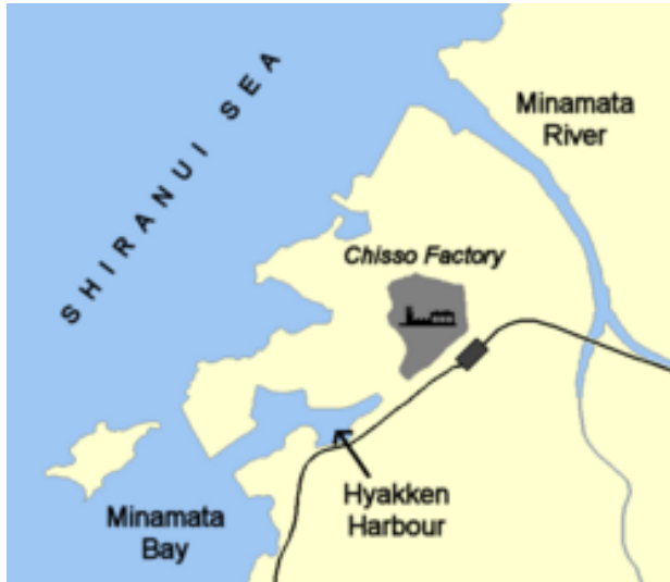
Chisso plant, the Shiranui Sea, and the plant runoff

I often used to go together with my blind, half-mad grandmother to visit this Umawari no Tomo, which in later years would take on such profound significance. There were also times that I went by myself. It was at the beginning of the Shōwa era, before I began primary school. No one lived on the embankment, and when adults gathered to drink they spoke about Umawari no Tomo as “the place where they come out to play”—they meaning various divine beings, foxes and kappa , “Motan no Moze” or “Tabira no Taze” or “Gane no Aragami-sama,” among other invisible deities. When night fell, from Nagasaki and Shimabara, from the Satsuma islands, they would come over, one after another, crossing the Shiranui Sea.