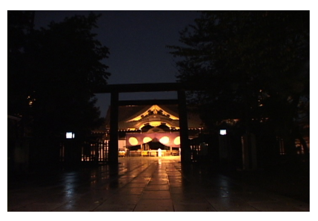
Yasukuni shrine at night.

Its name translates as "peaceful country," millions have silently prayed there for an end to wars, and for much of the year the loudest sound is the buzzing of insects and the shuffle of old footsteps to the hushed main hall. Yet Yasukuni Shrine, which occupies a single square kilometer of central Tokyo, is one of the most controversial pieces of real estate in Asia, resented by millions who consider it a monument to war, empire, and Japan's unrepentant and undigested militarism.