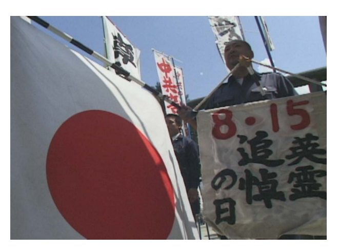
Former soldiers at Yasukuni on August 15, the anniversary of Japan's surrender in 1945.

\hat{a} \in "In a now familiar pattern, ultra-nationalists who follow in the shadow of establishment politicians, threatened retribution against anyone who handled the movie. Anonymous bloggers posted contact details for the distribution company, the Japan Arts Council and every theatre showing it. Anonymous death threats have been issued against Dragon Films, the company that produced "Yasukuni."