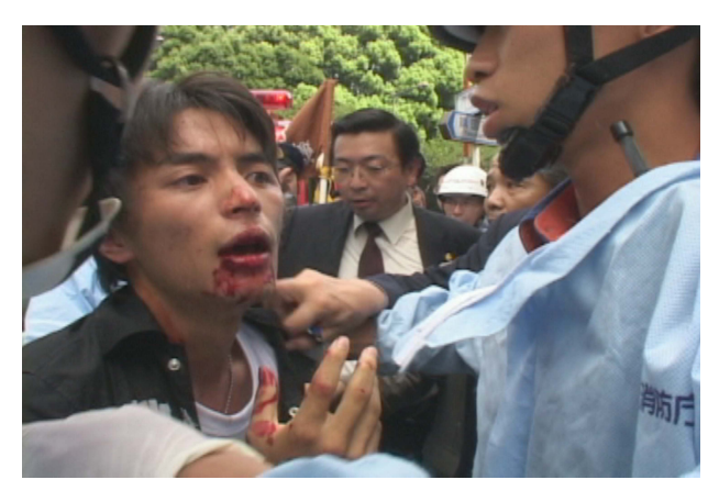
Protester beaten and taken by the police.